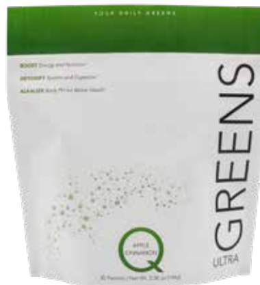
Nutrient-rich Greens Superfood Supplement

A powerful antioxidant that supports cell detox pathways.